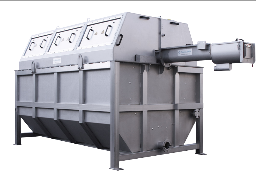
Rotary Drum Screen in tank RSH-MG