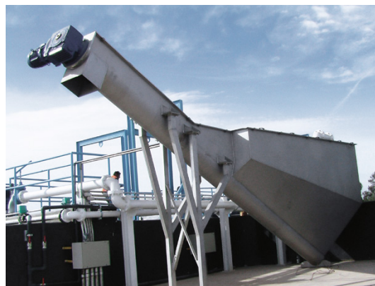
Installation for dewatering of grit trap settlings GS 130