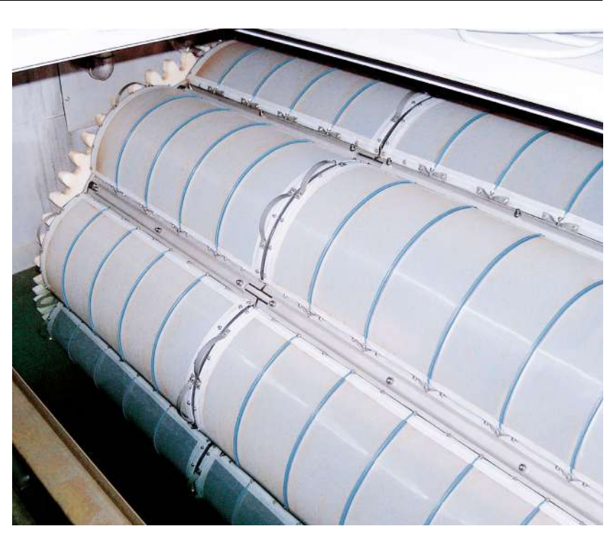
sieve baskets and sprocket, RSH-M