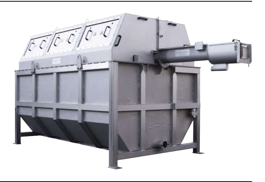
Rotary Drum Screen in tank RSH-MG